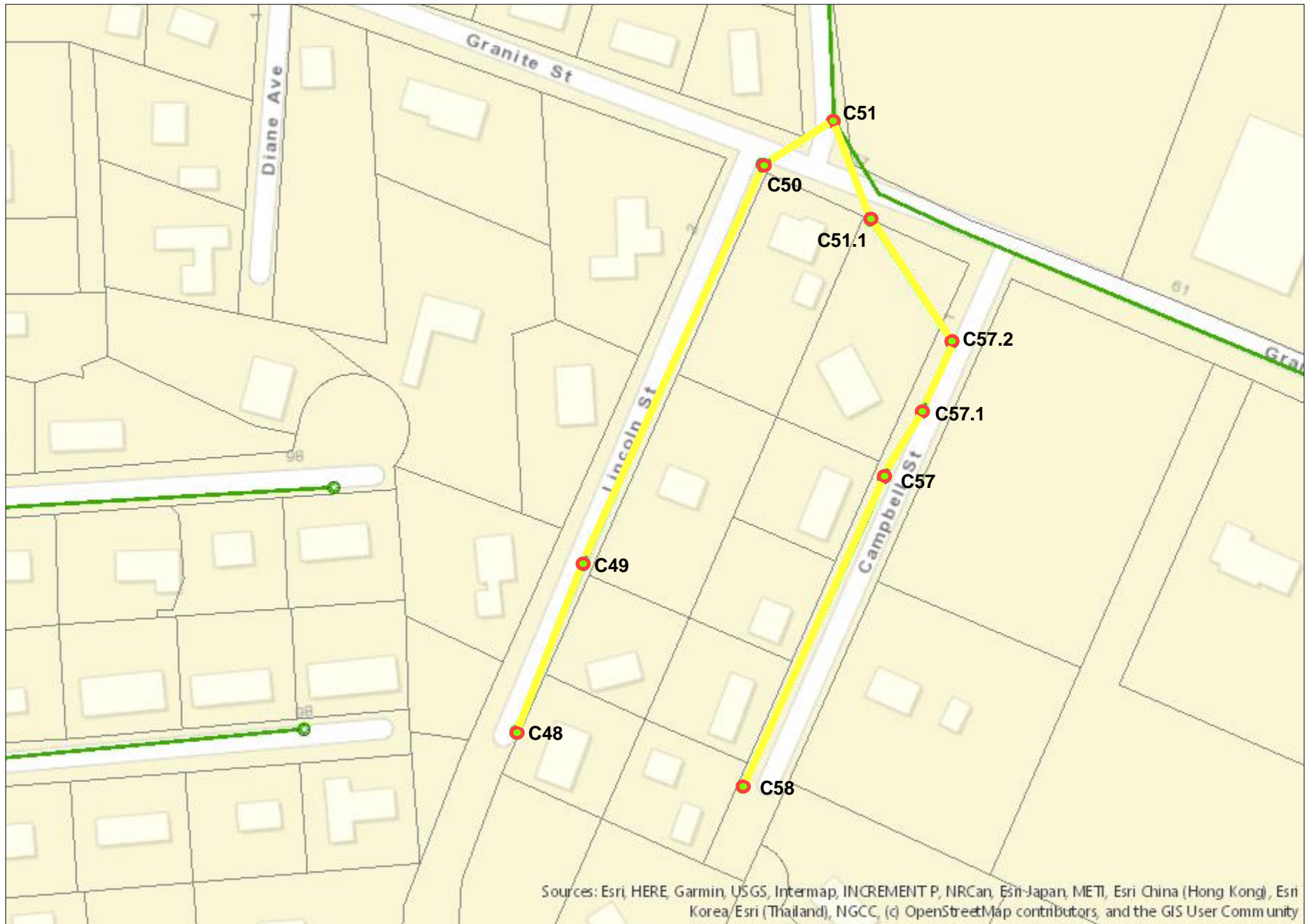
Lincoln Street C48-C50 approximately 565 ft 8" PVC. Lincoln Street C50 to Letendre Ave C51 approximately 75 ft 6" AC pipe. Campbell St C58-C57 approximately 310 ft 8" VCP pipe. Campbell St. C57 to Letendre Ave C51 approximately 370 ft 8" PVC pipe