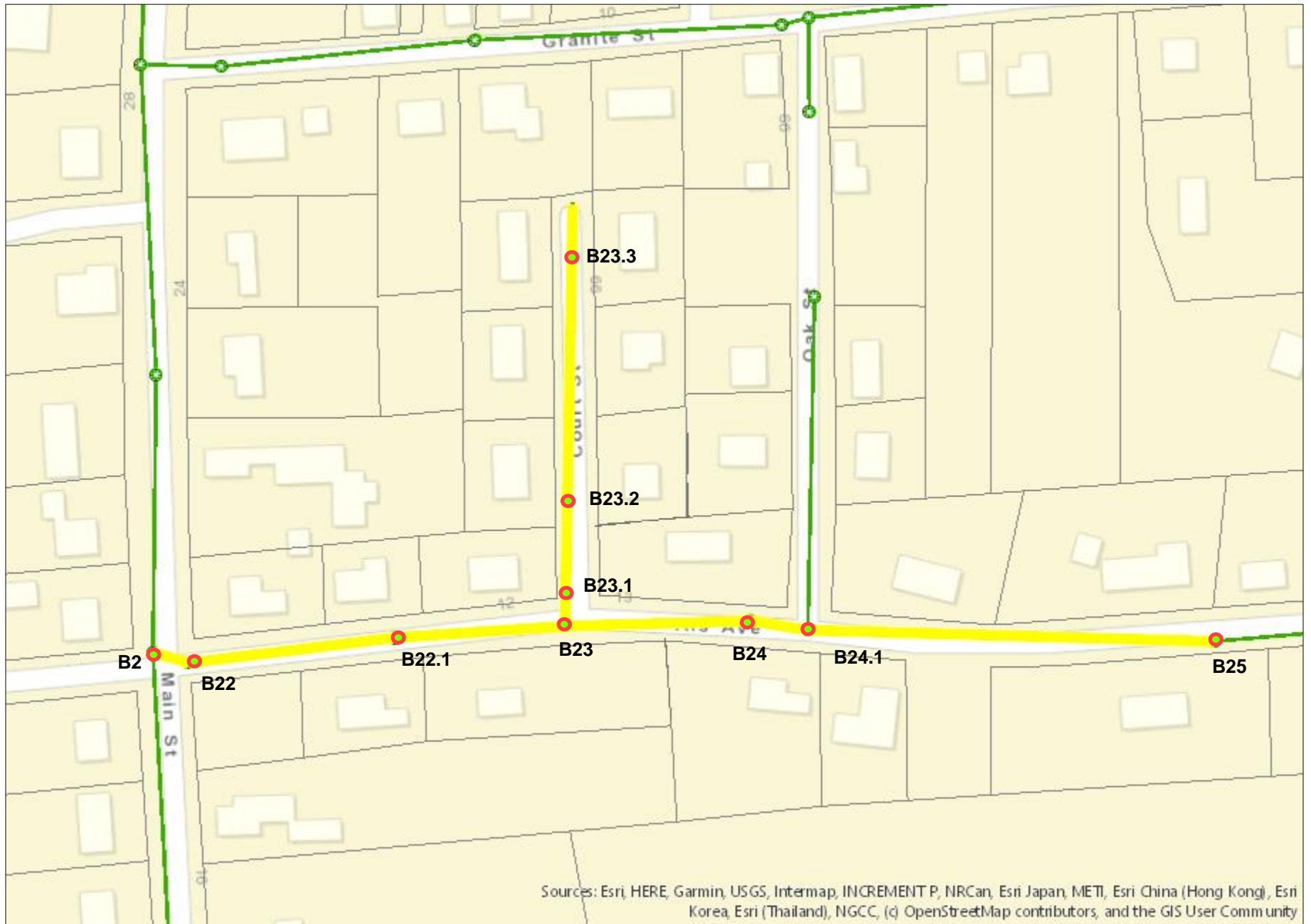
Als Ave B2-B24.1 approximately 600 ft 8" AC pipe. Als Ave. SMH B24.1-B25 approximately 370 ft 8" VCP pipe. Court Street B23-B23.3 approximately 385 ft 8" PVC pipe