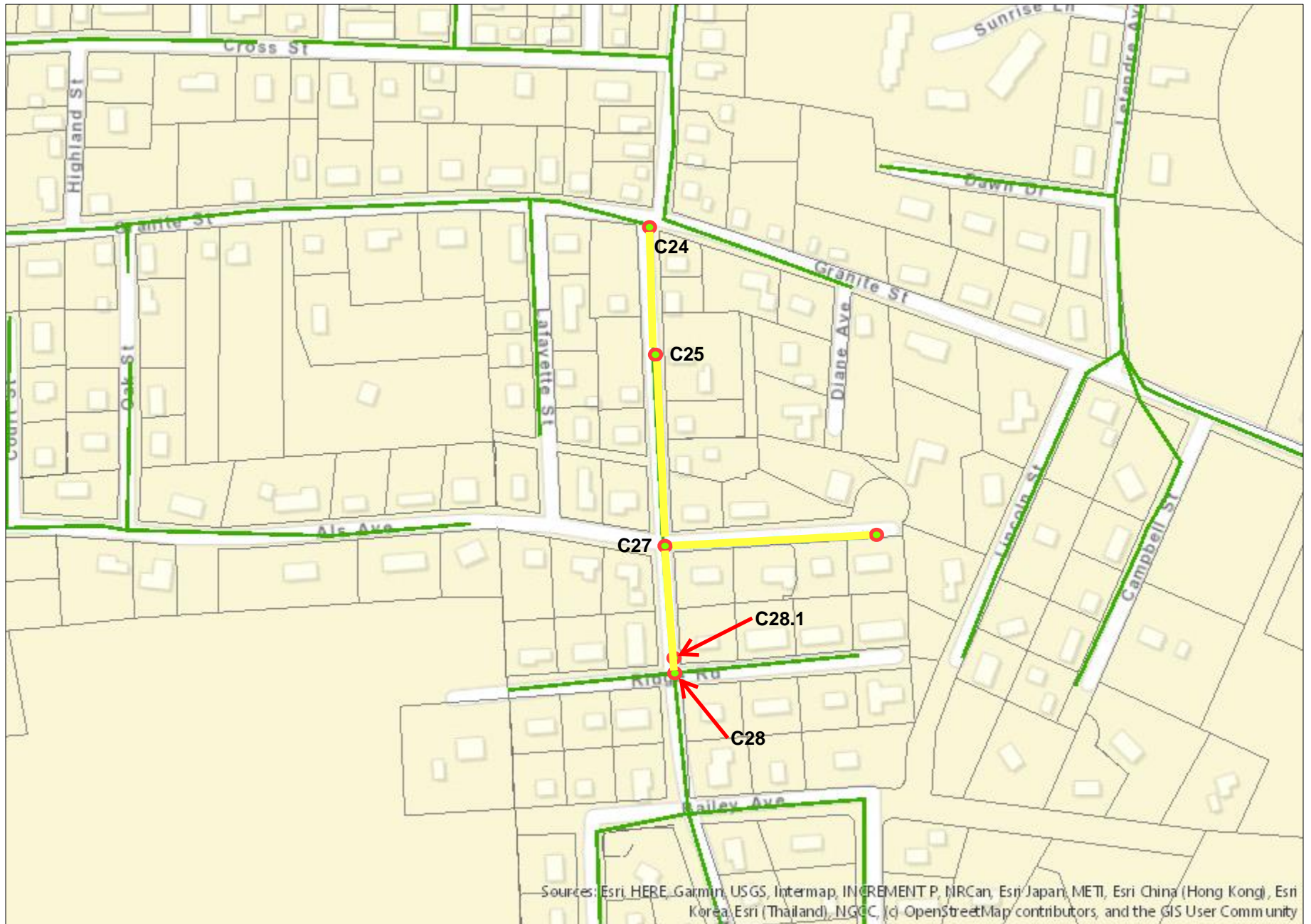
Notre Dame Ave. C28-C24 approximately 820 ft 8" AC pipe. Als Ave C27-C33 approximately 380 ft 8" PVC pipe.