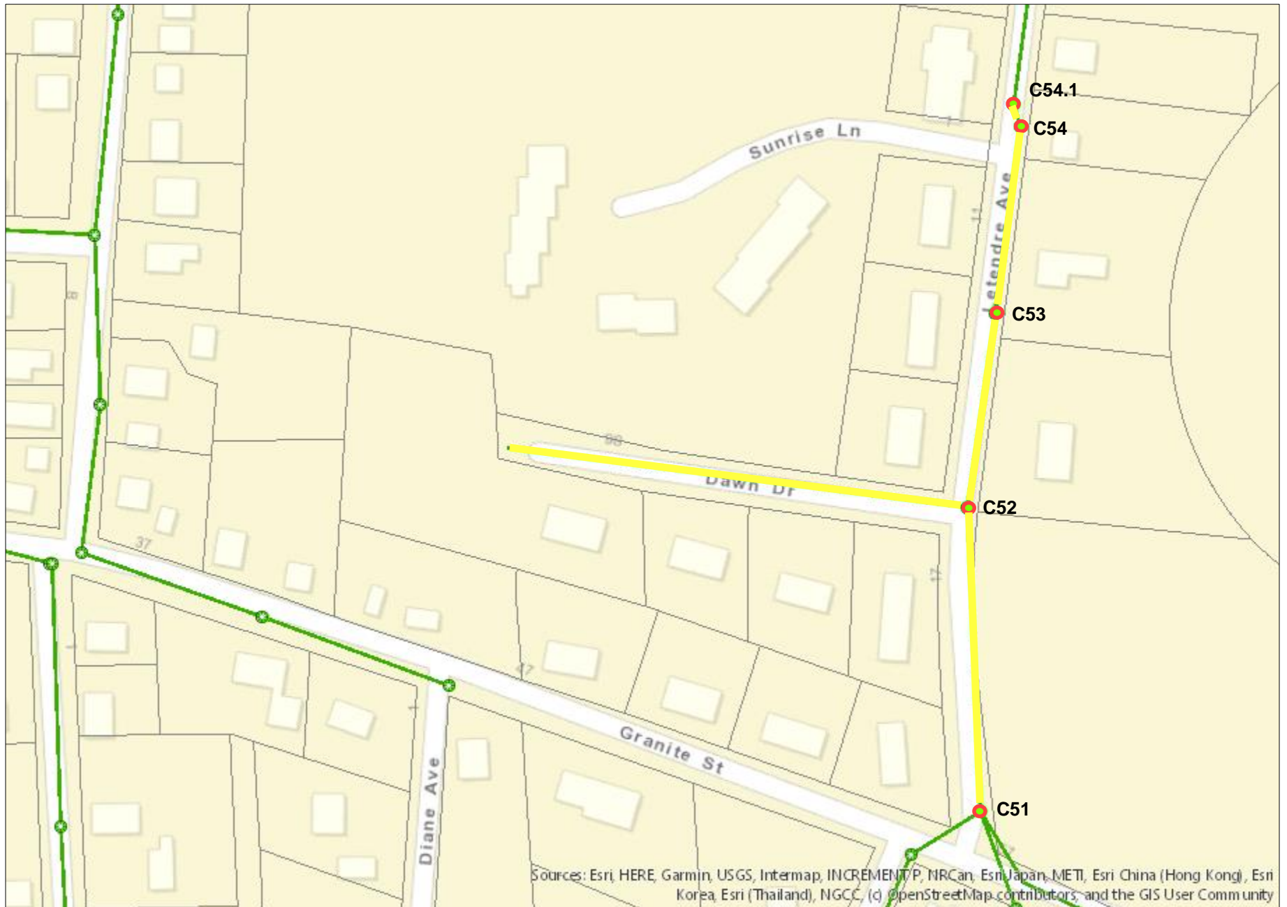
Letendre Ave. C51-C52 approximately 285 ft 6" AC pipe. Letndre Ave C52-C53 approximately 175 ft 6" AC pipe. Letndre Ave C53-C54.1 approximately 175 ft 8" AC pipe. Dawn Drive C52 to end of line approximately 430 ft unknown pipe and material.