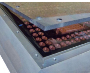
1/4" polycarbonate cover