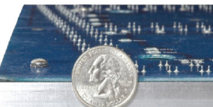
3/8" Bashplate protects LEDs