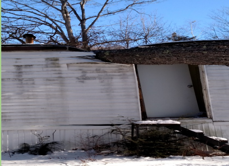
Tree on house January 2016

Description: Phone line to fire dispatch, telephone and internet access. This line is up due to an increase in the amount of internet speed By $1,000.