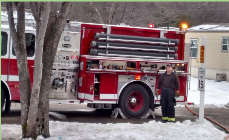
Building fire January 2016

Description: Fire Chief Cell Phone and ipads no change from last year