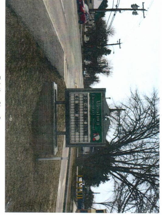
Existing Sign Specs: Height: 56" Width: 80"