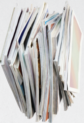
Magazines and Phone Books (catalogs and soft cover books)

No sorting on your end makes recycling quick and easy! Just focus on tossing all recyclables into one bin and Casella takes care of the rest. Please empty and rinse all containers as well as flatten and break down cardboard boxes.