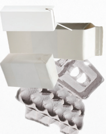
Paper Cartons (milk, juice, and egg)