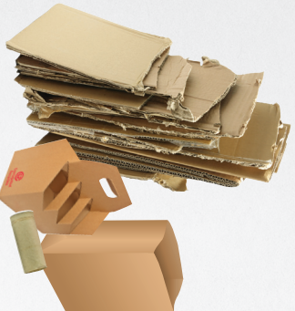
Corrugated Cardboard (boxes, paper bags, and beverage holders)