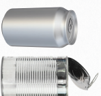
Metal Cans (aluminum, tin, and foil)