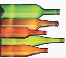
Glass Bottles (food and beverage)