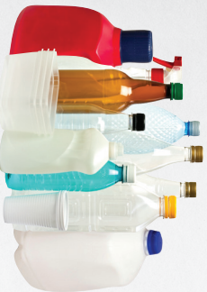
Plastic Containers (#1 - #7)