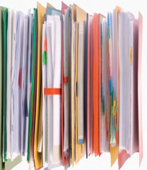
File Folders and Office Paper (all colors)