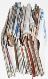
Newspaper (inserts and brochures)